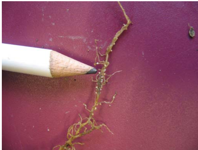
Figure 1. Soybean Cyst Nematodes on a soybean root. Note that they are much smaller than soybean nodules.

SCN causes the greatest yield losses of any single pathogen to soybeans in the world, causing up to 40% yield losses even before above ground symptoms are evident. SCN is a serious soybean pest that limits yield in many Ontario fields. It was first identified in Southwestern Ontario in 1988 and continues to spread into new soybean growing areas. It has now been verified as far east as Quebec (2013) and has spread north. SCN is known to be present in Huron county, however it's distribution and severity within the county are not well known. Many Huron county soybean growers do not recognize that SCN may be significantly reducing yields on their farms. Some growers consider SCN to be a problem limited to southern counties. Unfortunately, this is no longer the case.